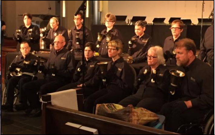
↓ Brookwood performs with HBE in 2017. ↑