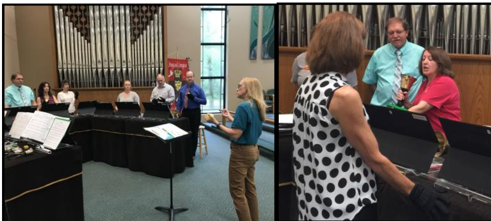
Build a Bell Workshop September, 2019 held at Living Word Lutheran Church in The Woodlands

For all of the contest rules, please go to our website. We look forward to hearing from handbell composers. http://houstonbronze.com/30th-anniversary-celebration-and-composition-contest.html