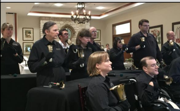
↓ Brookwood performs at the Brookwood Cafe, September 11, 2018 ↑