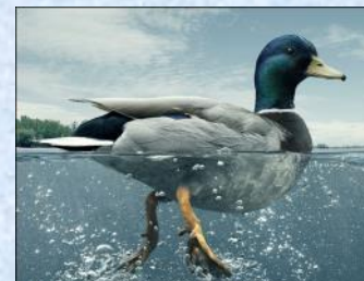
"Paddling like CRAZY!!"

All of this requires a huge commitment of time and energy from each of our members, but the rewards of playing to responsive audiences and helping other ringers improve their skills are definitely worth it! We greatly appreciate your concert attendance, likes on Facebook, questions and comments, donations, and every other form of support you offer – it is often the spark of motivation needed to continue to put in the time and effort needed to be excellent in all we do. We look forward to sharing another semester of handbell excellence with you and the Houston community!