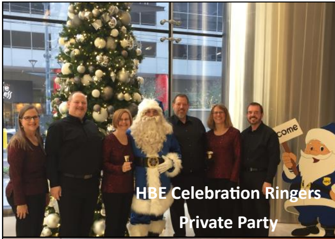
HBE Celebration Ringers Private Party