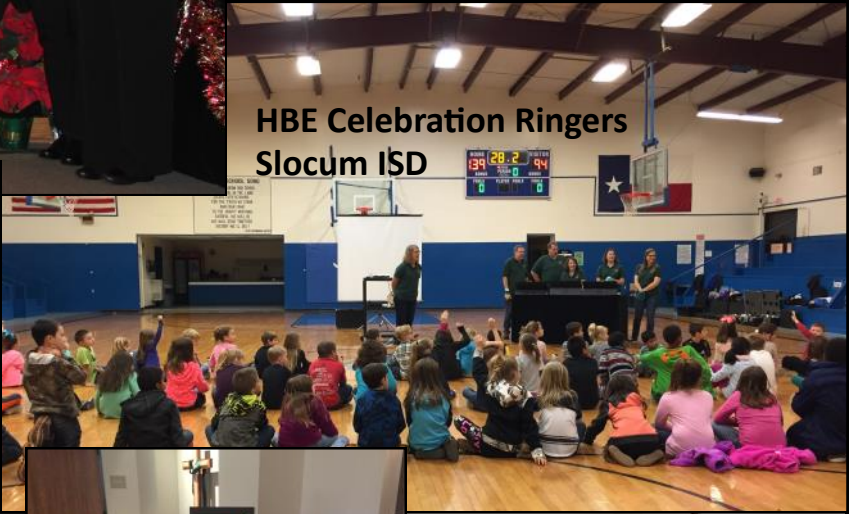
HBE Celebration Ringers Slocum ISD