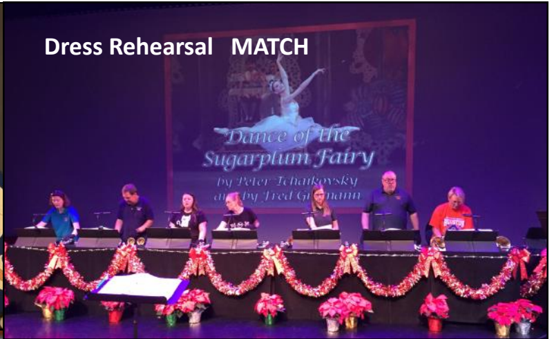
Dress Rehearsal MATCH