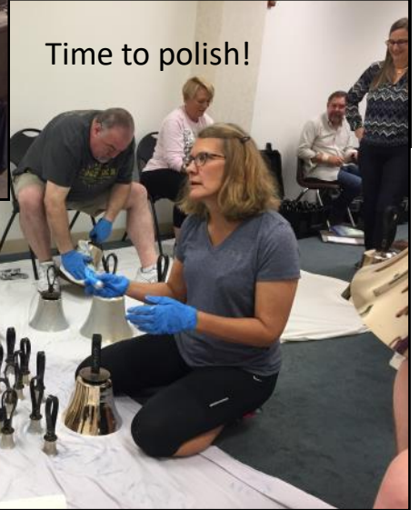
Time to polish!