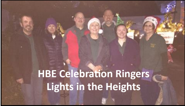
HBE Celebration Ringers Lights in the Heights