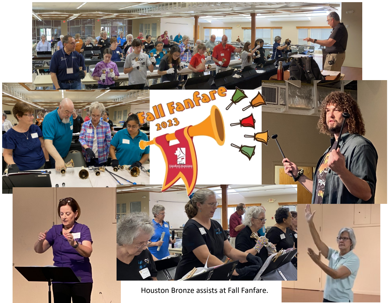
Houston Bronze assists at Fall Fanfare.