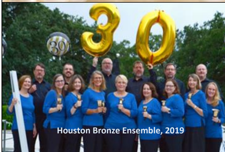
Houston Bronze Ensemble, 2019