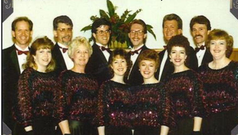
Houston Bronze Ensemble, 1989

Dedicated to HandBell Excellence Ensuring the future of handbells for ringers and listeners