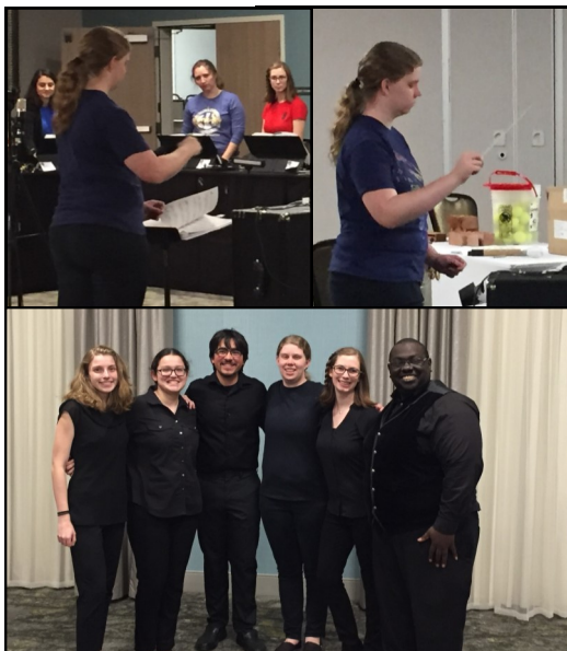
Houston Bronze College Ring-In 2020 scholarship winners